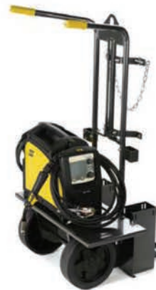
Trolley - for easier transport of gas bottle and Caddy® Mig.