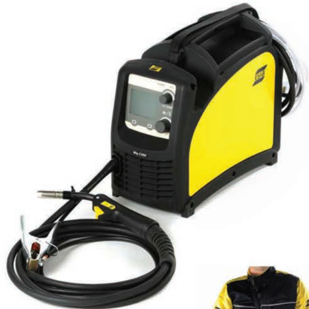
Supplied with shoulder strap.